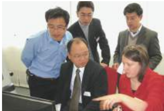
A FISCHER seminar teaches metrological basics and practical knowledge in small groups

Because we want you to receive maximum benefit from our products, FISCHER's experts are happy to share their application know-how. The seminars not only teach metrological basics but also hand-on experience in small groups to put the theory into practice.