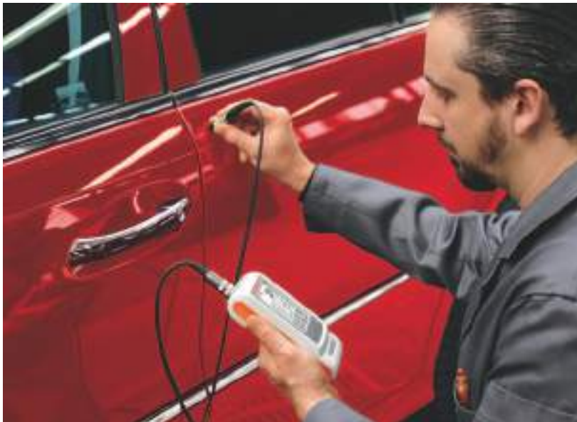
Measurement of auto body paint thickness using the dual probe FD13H

With the optionally available inspection plan management software, FISCHER DataCenter IP, this professional measurement instrument turns into multi-functional data terminal, opening up a whole new dimension in metrology. With the help of visually-aided operator guidance, individual inspection plans created on a PC can be executed step-by-step on the instrument – and the results evaluated conveniently at the PC.