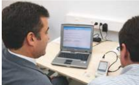
User training for the DUALSCOPE® FMP100 on-site at the customer's

With our training program we make your employees fit on-site for your measuring task. Our trainer takes account of your individual requirements and wishes.