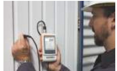
Measurement of paint coating thickness

The DUALSCOPE FMP100 uses both the magnetic induction method (DIN EN ISO 2178) and the eddy current method (DIN EN ISO 2360). It can measure the following coating/substrate systems: