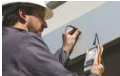
Measurements of anodised aluminum on a façade