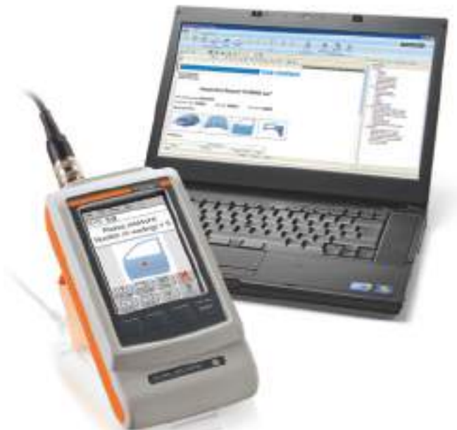
The inspection plan, created on a PC, is loaded up onto the instrument. The instrument shows the measurement spots directly on the specimen and the number of the required measurements

With the optionally available inspection plan management software, FISCHER DataCenter IP, this professional measurement instrument turns into multi-functional data terminal, opening up a whole new dimension in metrology. With the help of visually-aided operator guidance, individual inspection plans created on a PC can be executed step-by-step on the instrument – and the results evaluated conveniently at the PC.