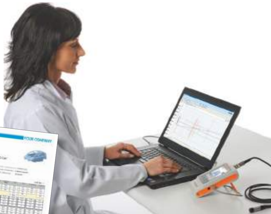
Evaluation at the PC with the PC software FISCHER DataCenter. Presentation of the measurements in the Factory Diagnosis Diagram (FDD)