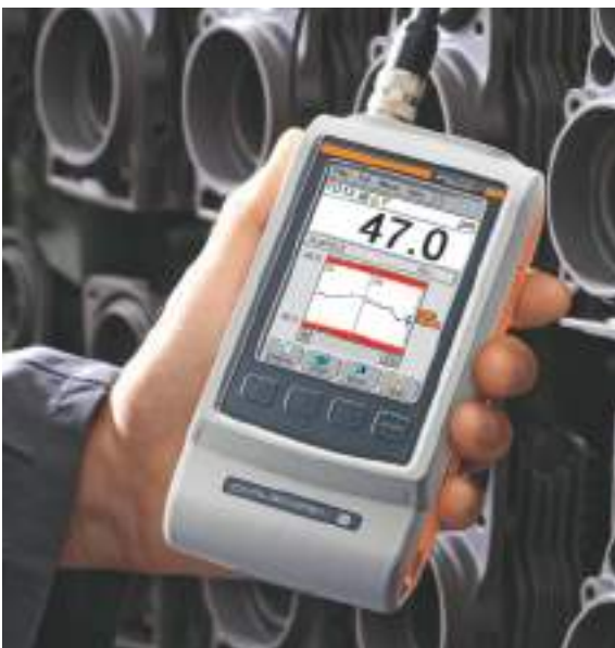
Graphical display of the measurements with the set specification limits. The histogram of the measurements is additionally shown on the right display site