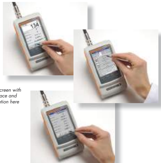
Graphic display screen with menu-driven interface and touchscreen operation here with a stylus