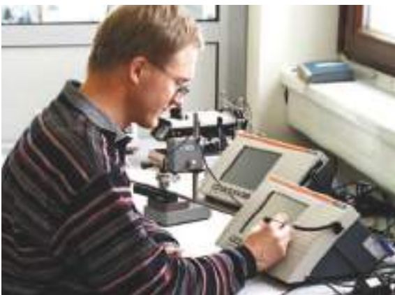
Measuring on a customer's specimen in a FISCHER application laboratory

More and more, demanding applications require highly qualified application advice. FISCHER addresses this need with its application laboratories located around the world (Germany, Switzerland, China, USA, India, Japan and Singapore).