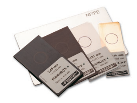
As a DAkks-accredited company, FISCHER offers a variety of calibration standards

A USB port is available for transferring the data to a PC or laptop, where, using the FISCHER DataCenter software, the values are quickly imported and easy-toread reports generated.