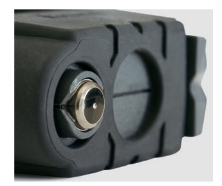
The carbide probe tip is especially wear-resistant and stands up to thousands of measurements

For fast and error-free reading of the measurement results, the devices are equipped with two lighted graphical displays. When measuring overhead or on slanted or vertical surfaces, the display rotates automatically. An LED on the top of the unit signals whether the value just taken is within the tolerances previously entered.