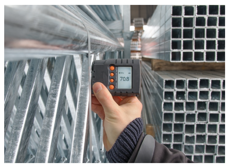
The lit display rotates automatically, allowing easy readout in any measurement position