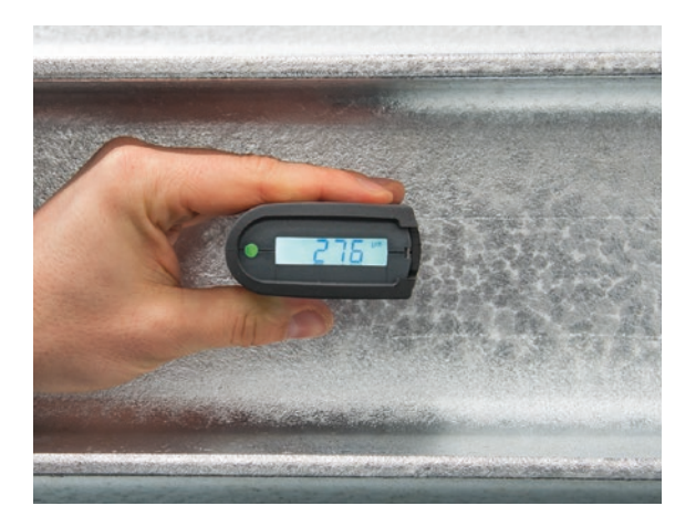
An LED shows immediately whether the value is within tolerance

To ensure stable positioning on the sample, the devices are equipped with a three-point support. That combined with curvature compensation guarantees reliable measurements even on non-flat surfaces.