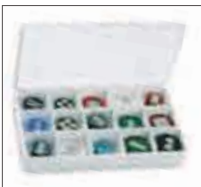
Specimen storage box