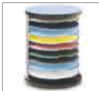
Storage rack for your consumables