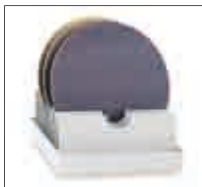
Draining for plates storage