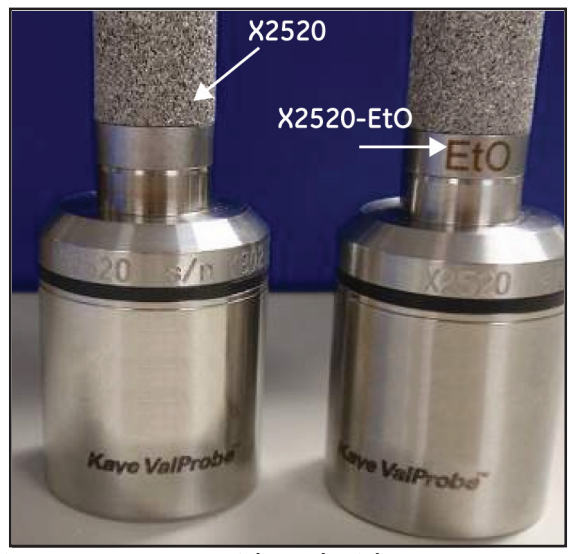
Figure 3: Loggers with and without ETO on Cap

The ValProbe loggers can be distinguished externally by the marking on the ValProbe cap. All the loggers shipping from the factory from 1 Mar 2010 have this marking. The loggers with ETO on the cap (Figure 3 below) include the EMD3000 sensors. Users should not interchange these caps with loggers having the EMD4000 sensors.