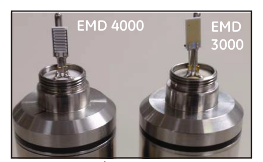
Figure 2: EMD3000 and EMD 4000 Sensors on Loggers

The ValProbe loggers can be distinguished externally by the marking on the ValProbe cap. All the loggers shipping from the factory from 1 Mar 2010 have this marking. The loggers with ETO on the cap (Figure 3 below) include the EMD3000 sensors. Users should not interchange these caps with loggers having the EMD4000 sensors.