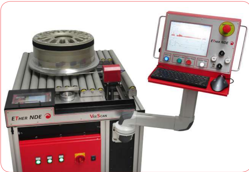
VeeScan Pivot Arm Option.

At ETHER NDE we understand that the key criteria for any Aircraft Wheel Inspection System is the need to guarantee detection of defects, the requirement to operate reliably twenty-four hours per day, 365 days per year. The demand for a simple and user-friendly interface and the business need to maximize speed of inspection and output is key. Balancing these objectives can be difficult, but we believe the VEESCAN measures up to the task.